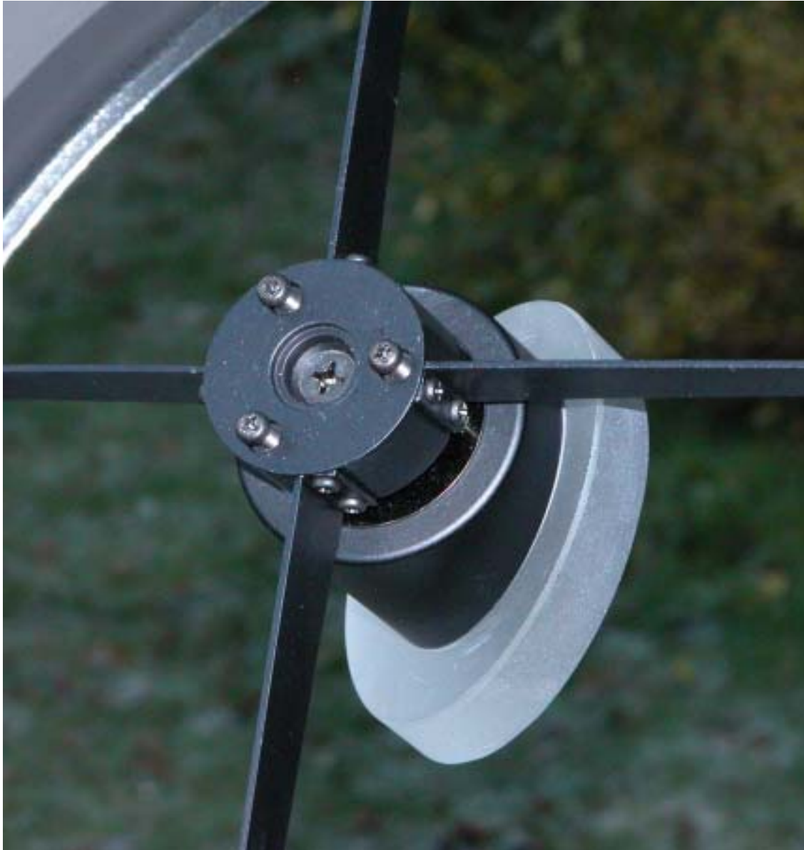
Photo 4: the secondary mirror and secondary mount with the three collimation bolts

secondary mount assembly moves and the laser spot has to be moved past the center spot, bouncing back to the opposite side of the primary center spot when letting the tension on the bolt go.