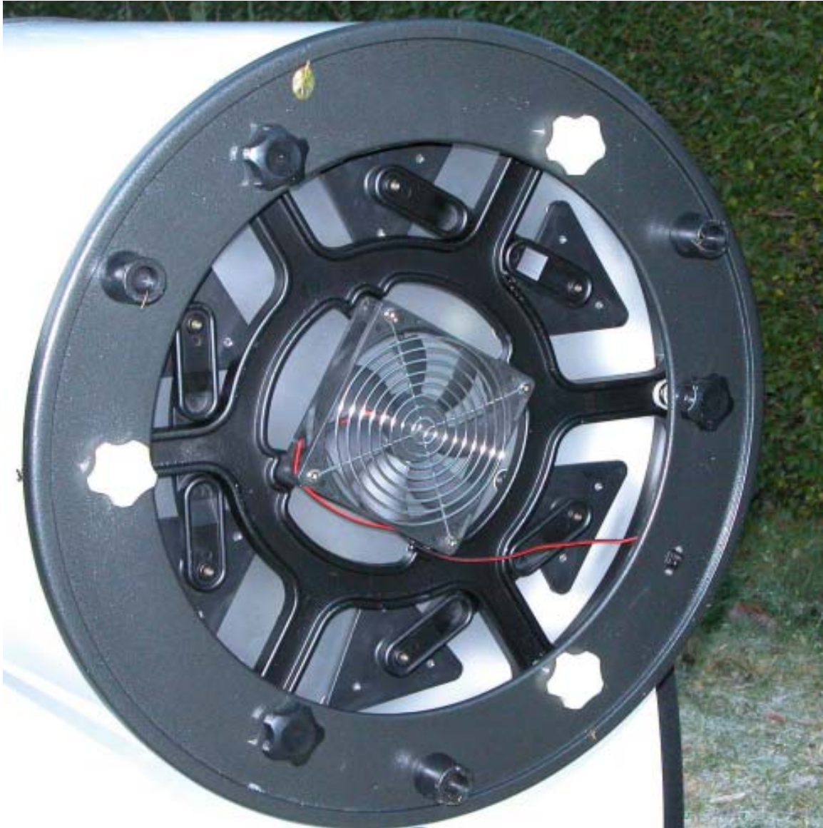
Photo 5: Rear view of mirror cell with collimation mechanism and cooling fan

All knobs move smoothly, without the need to use much force. I prefer collimation systems without extra fastening knobs, but this system works nicely and without any problem on this telescope.